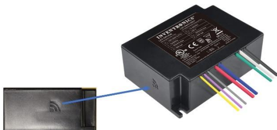
Figure 2: Radio Location Indicator

Programming your Inventronics NFC LED driver is fast and efficient. Each NFC LED driver has a radio location indicator on the driver (Figure 2). Simply line up the NFC reader with the radio location indicator and read/write as normal using the Inventronics Multi-Programmer software . Inventronics does offer a handheld (Figure 3) and desktop programmer (Figure 4) for added convenience, but any NFC programmer that adheres to the Zhaga Book 24 specifications is supported.