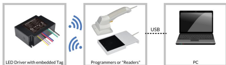
Figure 1: NFC Programming System

NFC is a wireless technology globally available in the 13.56MHz unlicensed radio frequency range and is designed for short range data transfer. It is currently used in a variety of applications such as “point-of-sale” devices, parking meters, turnstiles, garage doors and mobile devices. NFC communication requires two devices, an NFC reader and an NFC tag. The NFC tag is typically embedded in a device, such as a turnstile or LED driver. The NFC reader is designed to read and write information to the NFC tag and is often embedded in a smartphone, or a standalone unit that connects to a PC. In Figure 1, you can see the reader is connected to a host PC that uses software to transmit programming data between the reader (or programmer in this case) and the tag embedded in the LED driver.