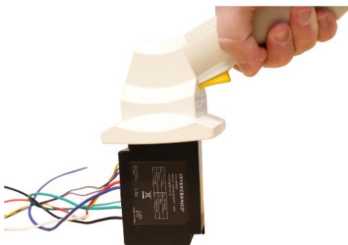
Figure 3: Handheld NFC Programming Device